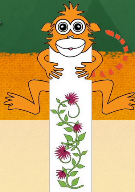
Leaf Monkey Bookmark